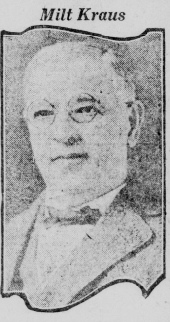
Republican Congressman renominated in Eleventh district.