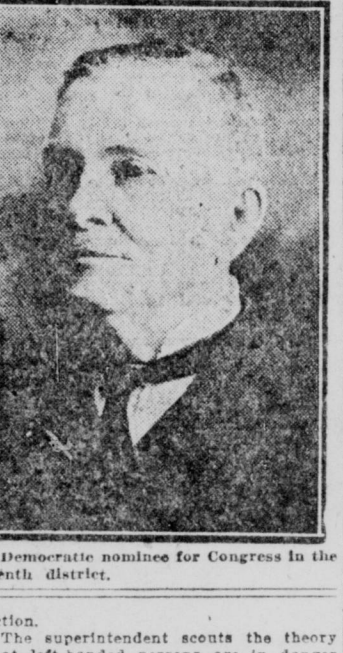
Democratic nominee for Congress in Tenth district.