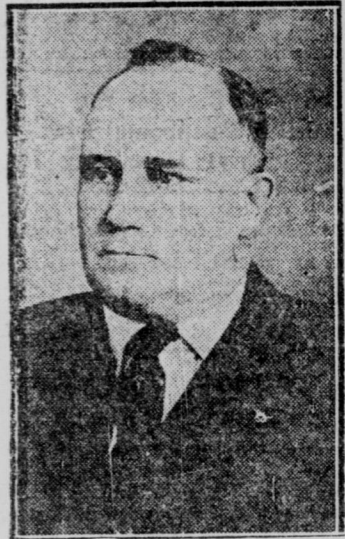
Democratic nominee for Congress in Fourth district.