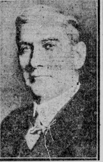
Republican Congressman renominated in Eighth district.