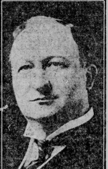
Republican Congressman renominated in Ninth district.