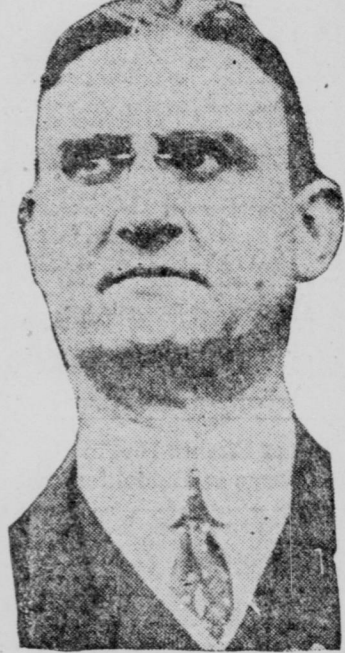
Republican Congressman renominated in Thirteenth district.