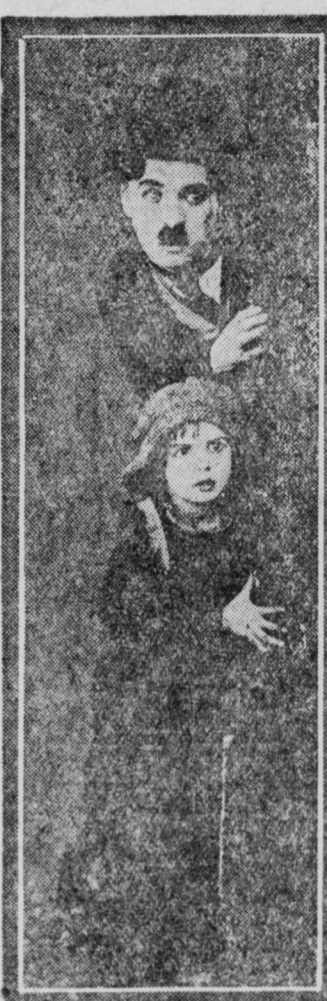
CHAPLIN AND JACK COOGAN.

Because of the big business done by Charlie Chaplin and Jack Coogan in "The Kid," this picture will be held over next week at the Circle. It is understood that this Chaplin picture has broken all attendance records at the Circle. Never has Chaplin appeared to a better comedy advantage than in this movie.