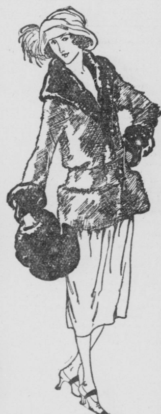
—Pettis coats, second floor.

Trimmed with contrasting fur or plain. Just ten coats in the lot—so come early if you want one.