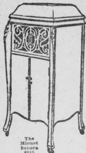
The Minuet Sonora $215

CONSIDERING the variety of entertainment a good phonograph affords—the number of people it may en- tertain—its enduring usabil- ity—its easy adaptability to any size room—and above all the pride of possession its beauty and performance brings—is it any wonder that the Sonora phonograph takes an assured position as the Perfect Gift!