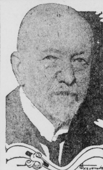
HENRY ARTHUR JONES.

"The motion picture industry," he says, "is only in its babyhood. It has a most ductile and facile technique; a boundless comprehension of events; an almost diabolical power of suggestion and insinuation and an equally great power of vivid, startling contrast. It has an infinite variety of action and world-wide freedom of movement. In all these respects the film offers to dramatists lavish opportunities which are denied by the spoken stage. It also has a greater command and a truer presentation of landscape than the