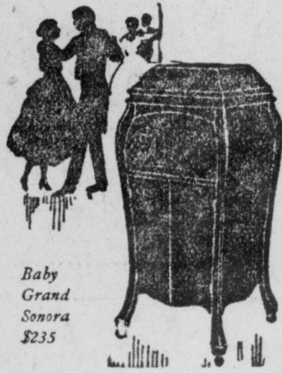
Baby Grand Sonora $235

Delight the whole family with a Sonora for Christmas. Music belongs to Christmas, and in Sonora's golden throat rests the whole world of music. Every disc record ever made can be played on this instrument with exquisite tonal perfection.