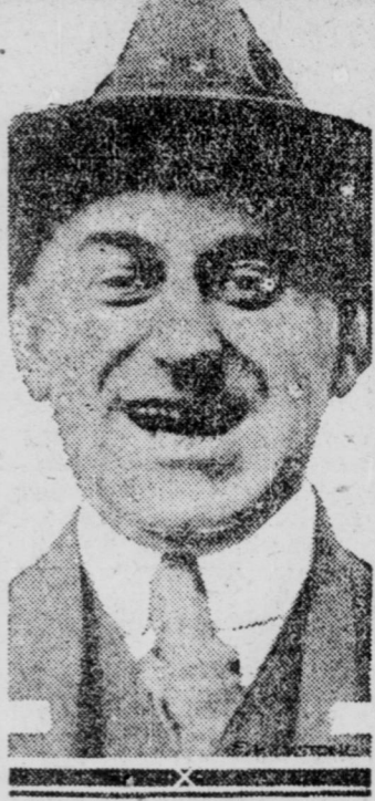
CHANNING COX. Channing Cox, Republican, is the new Governor-elect of Massachusetts and hence will step into Governor Coolidge's office Jan. 1, when Coolidge steps out to take his place as Vice President March 4.