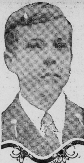
PRINCE CHARLES OF BELGIUM. Recent reports state that Prince Charles of Belgium, second son of King Albert, has been offered the throne of Greece. It is said now that Prince Paul, ex-King Constantine's son, has refused the offer of the throne because Premier Venizelos would still retain his power.