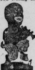
Al Jolson... laugh himself to death.

After Jolson and his entertainers have convulsed the Prophets at the Murat, the guests will depart for the Athenaeum, where the Grotto will hold a reception. There will be dancing and refreshments and as soon as Jolson and the members of his company get into their own evening clothes they will join the Grotto members and friends. Now it must be remembered that Jolson is as much at home off the stage as on and it is hard to guess what he will not do when among friends. Who knows? Jolson might grab a fez, do a fox trot in front of the famous turkey and that old bird might laugh himself to death. Who can tell?