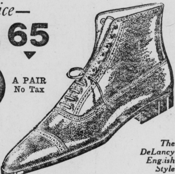
The DeLancy English Style

This is the greatest price reduction on men's fine shoes on record this season or in many past seasons. Every pair is brand new and up-to-date.