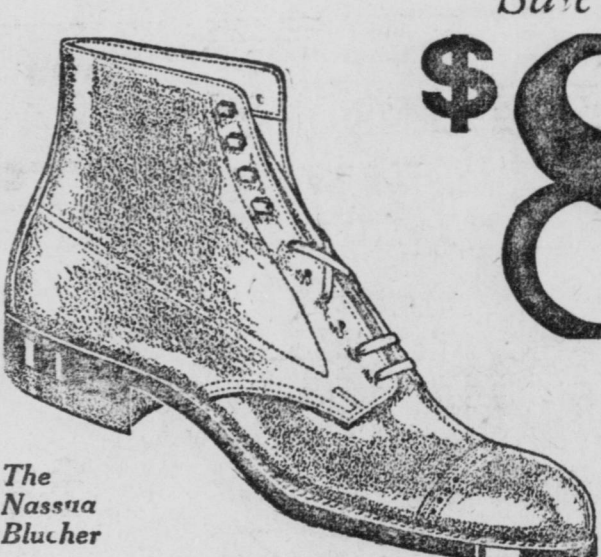
The Nassa Blucher