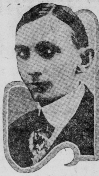
CHARLES WAKEFIELD CADMAN.

There are no changes today in the bills of the following houses: The Circle, the Murat, English's, Regent, Colonial, Isis, Mister Smith's, Broadway, Rialto, Keith's, Lyric and Ohio.