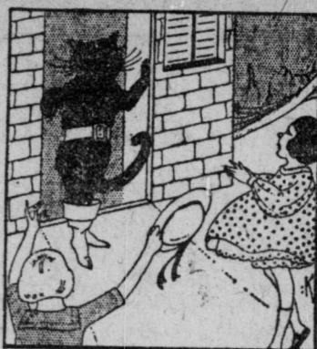
The children were delighted when Puss came out to play.

our journey until morning, but those children woke up—and here we are."