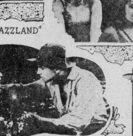
"THE IDOL DANCER" CIRCLE