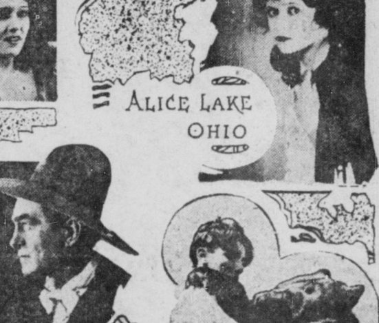
HARRY CAREY REGENT