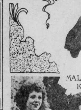
MALE & FEMALE KEYSTONE