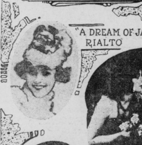
"A DREAM OF JAZZLAND" RIALTO