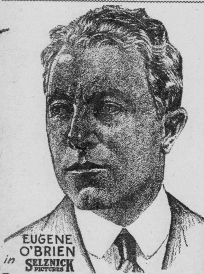
EUGENE O'BRIEN in SELZNICK PICTURES