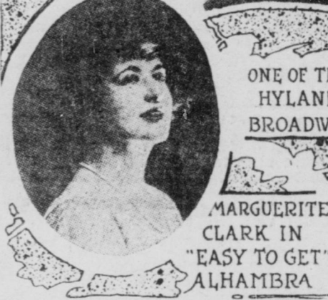
MARGUERITE CLARK IN "EASY TO GET" ALHAMBRA