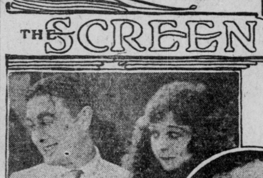
OWEN MOORE & SEENA OWEN COLONIAL