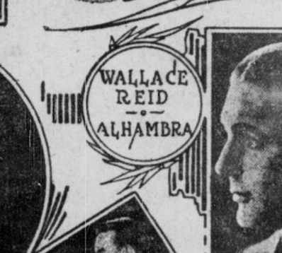
WALLACE REID ALHAMBRA