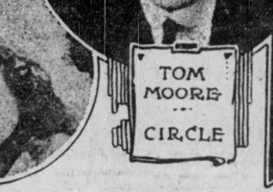
TOM MOORE CIRCLE