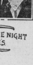
PARTNERS OF THE NIGHT MR. SMITHS