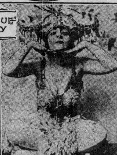
"DOLL REVUE" BROADWAY