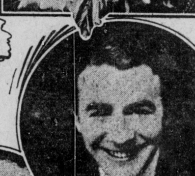
TOM MOORE CIRCLE