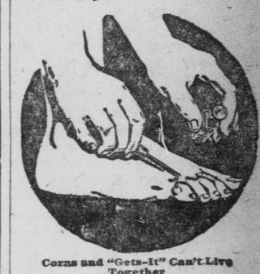
Corns and "Get-it" Can't Live Together

The hurting "pep" goes right out of that corn the moment a few drops of "Get-it" lands thereon. It is thorough, and "for keeps."