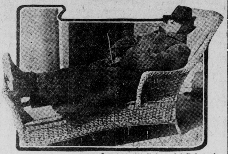
Albert J. Beveridge.

Doesn't look very progressive, but his friends claim he is.