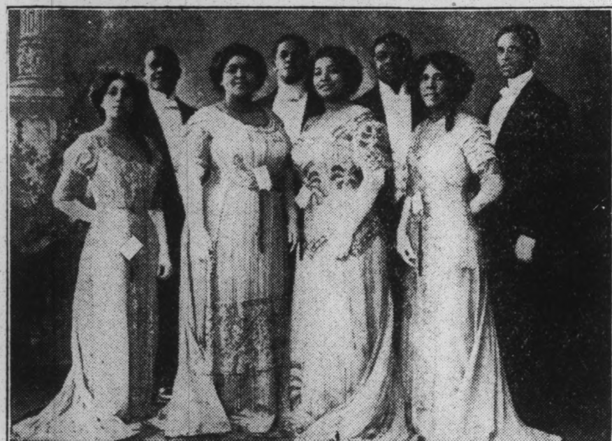
FAVORITES OF TWO CONTINENTS