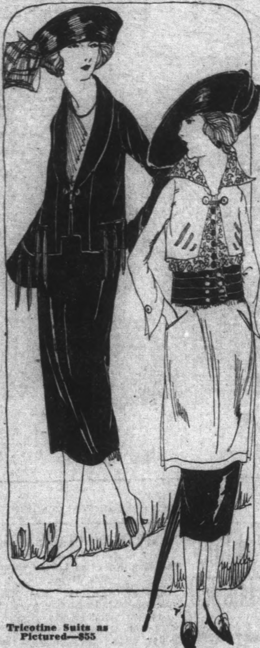
Tricotine Suits as Pictured—$55

And to complete the style and size range, the color and the fabric assortment, we selected from our regular stock several dozen models we thought worthy of this event and grouped them all to go into this sale at