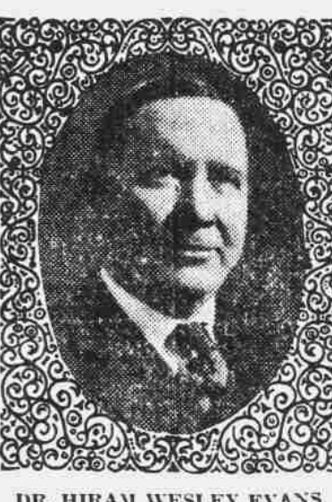
DR. HIRAM WESLEY EVANS.

the conclusion that the only possible salvation of nationhood is in organization." "It may be added that organization that saves is not merely material—it has life and thought and purpose. These must be welded into one overwhelming power which is to produce a national patriotic mind, rich in tradition and in racial instinct—capable of guarding the national heritage from every attack, and bringing it to perfection." "The Klan has begun consciously to take up its great task of defending mankind against those who, under a camouflaged plea for a universal brotherhood and the absolute equity of all peoples regardless of race, instinct or ability, are seeking the destruction of true democracy." "The Klan has passed from the period of formation, simple problems and confused purposes, into the stage of conscious unity for the greatest task in all history."