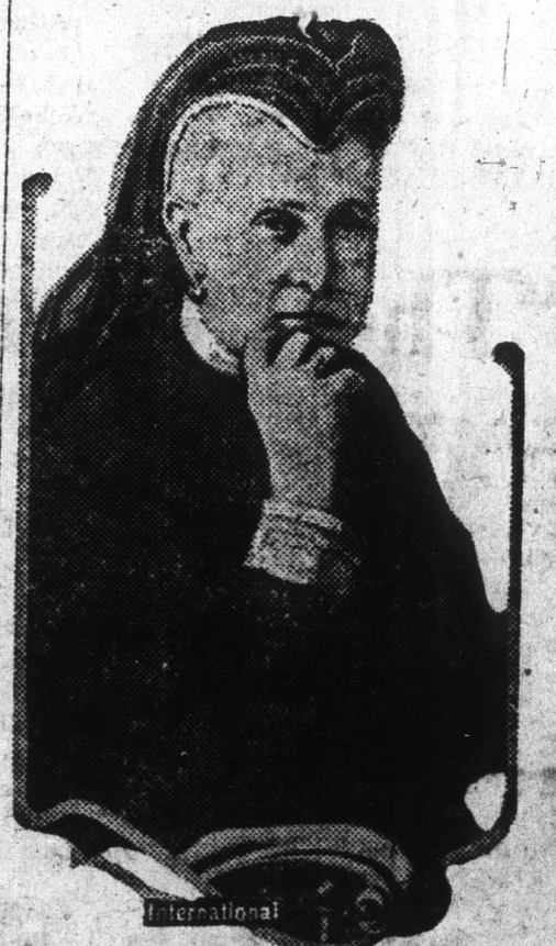
A new portrait of Olga, the queen-mother of the Hellenes, who was recently appointed regent of Greece, following the resignation of Admiral Coundouriotis. She is known to the Greek people as "Mama" (mother).