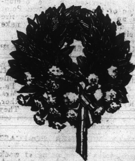
Say It With Flowers