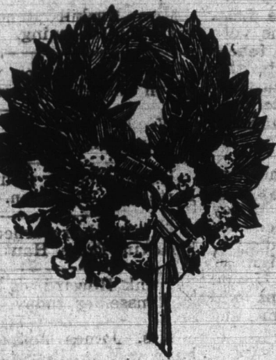
Say It With Flowers Holden's Greenhouse

Suggests redecorating Put your call in early and see the latest designs in Wall Coverings shown in the complete sample line of L. C. ORRELL & CO. Wall Papers. We will gladly submit this line for your inspection, make suggestions in decorative schemes, and bid on the work without obligations. C. E. OSBORN Phone 223