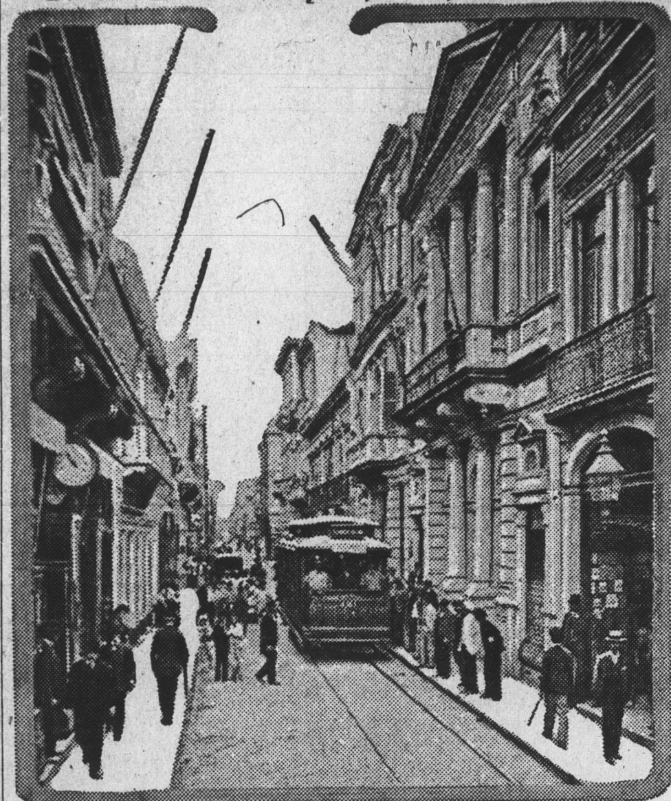
Street Scene in Sao Paulo.

S AO PAULO, or, to use the English equivalent, St. Paul, is the capital and business metropolis of one of Brazil's greatest states. Of the 20 states, one territory and one federal district into which the great southern republic is divided, the state of Sao Paulo and its splendid capital stand among the most progressive units of the entire nation.