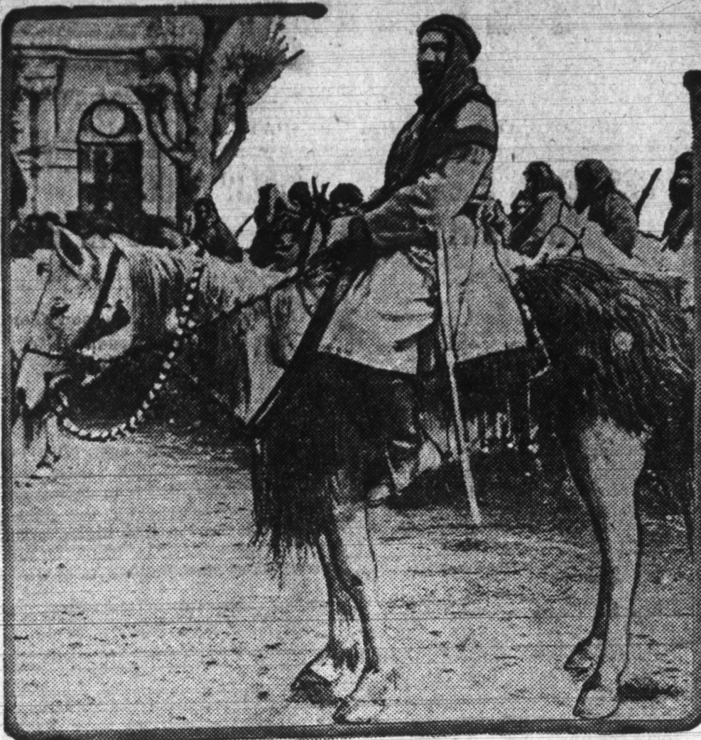
One of the Kurdish horsemen who have been massacring Christians in Persia near the Turkish border.

perment of keeping the whole of this famous battalion behind the line, and training all ranks as officers. As they reached a certain standard of progress they were given commissions and drafted to regular battalions. I made careful inquiries as to how this experiment had worked out in practice. One corps commander told me he had received a large number of these new officers from the Artists' Rifles, and that with extremely few exceptions they had turned out admirably.