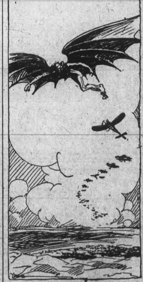
Whither He Was Leading Them, None but Himself Could Guess.

air bank that opposed them with a solidness that caused the light plane to shudder and shiver at the impact, and wherein the machine again seemed a ship wallowing in a sea that had swept her from stem to stern, until shaking herself free she once more raced on, buzzing like a hornet. (TO BE CONTINUED.)