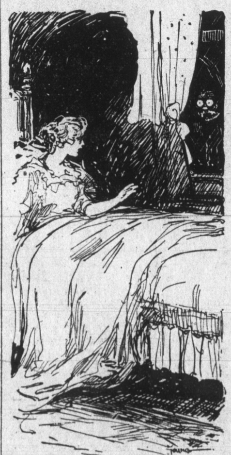
"He Was Making Mouths at Me."

ative. He was after you, reaching for you, and of course I could not permit anything like that from man or beast if the advance was repellent to you. You did not wish him to touch you?"