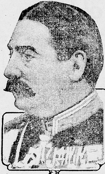
GENERAL VON HAUSEN.

General von Hausen, formerly min- ister of war in Saxony, is now in com- mand of the army of that state, whose line of operations extends from Berry- au-Bac to Vouziers, where they join with the duke of Wurttemberg's cavalry.