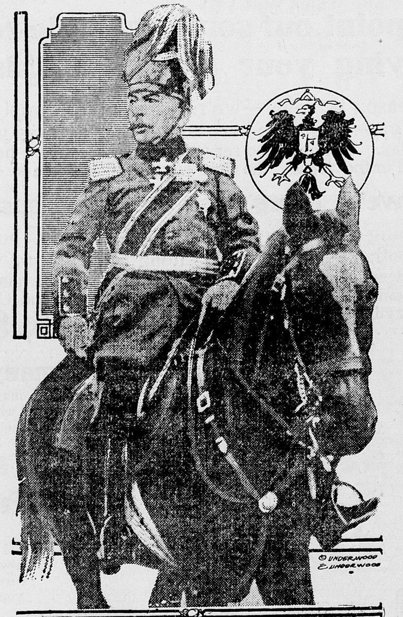
GENERAL VON EMMICH.

By conquering Liege and smashing the Belgian power, General von Em- mich won for himself a bright page in German military history. He was per- sonally congratulated by Kaiser Wil- helm for crushing the Belgians. This is von Emmich's latest photograph, and was made since the fall of Liege.