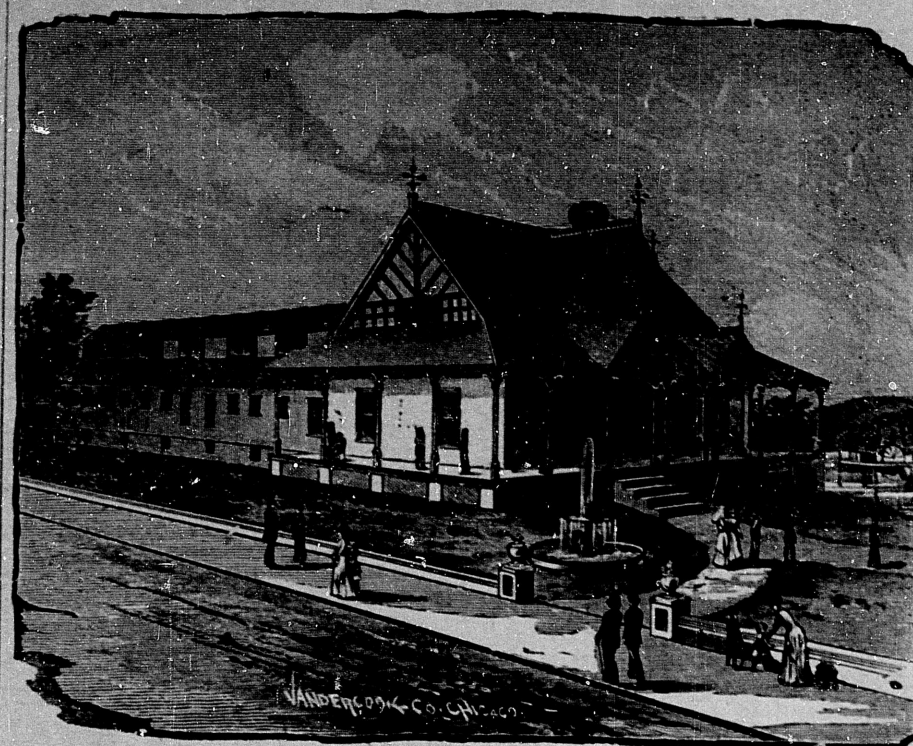
THE MOST EFFICACIOUS WATER in the world for the cure of Rheumatism, Skin and Blood Diseases, Catarrh. The most perfectly appointed Bath House in the West.