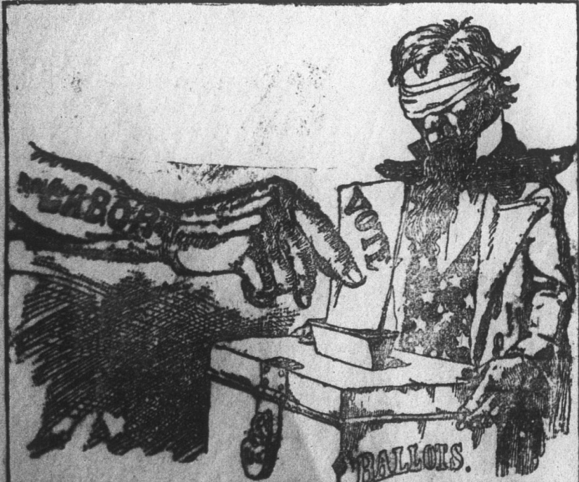
THE HARD TIMES WILL SETTLE MATTERS THIS FALL.