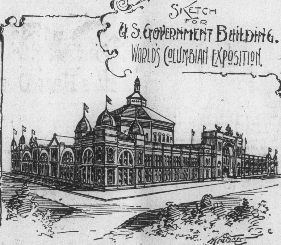
SKETCH FOR U.S. GOVERNMENT BUILDING. WORLD'S COLUMBIAN EXPOSITION.

There are several sizes of paper wheels made, for instance, 42-inch wheels, 33-inch, 30-inch, 28-inch and 26-inch. The last two sizes are locomotive truck wheels. Some roads use paper wheels exclusively under their passenger equipment and cast iron ones under the freight equipment. These