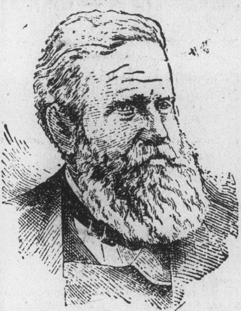
DOM PEDRO II. DE ALCANTARA, LAST EMPEROR OF BRAZIL.

Dom Pedro is descended from three of the proudest and most ancient royal families in Europe. His paternal ancestors were the Braganzas, his grandmother was a Bourbon, and his mother a Hapsburg. The Brazilian dynasty came into existence through the wars