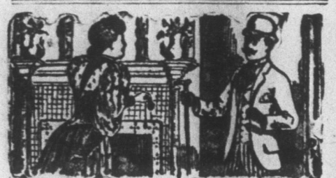
"Hello! Tom. Glad to see you, old fellow! It's almost ten years since we were parted. Sit down; let's have an experience meeting. How's the wife?"

"Oh, she's so-so, same as usual,—always wanting something I can't afford."