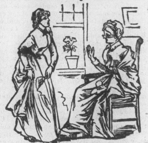
The Return Home.

"Just look at my dress. It is almost spoiled. We had one of those small sieve dusters. They are no good."