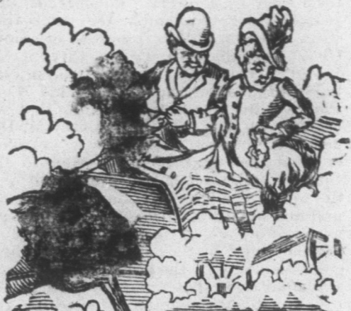
The Dusty Ride.

DEEP SEA WONDERS exist in thousands of forms, but are surpassed by the marvels of invention. These two are in need of profitable work that can be done while living at home should at once send their address to Halle & Co., Portland, Maine and receive free, full information how either sex, of all ages, can earn from $5 to $25 per day and upwards while they live. You are started free. Capital not required. Some have made over $50, in a single day at this work. All succeed.