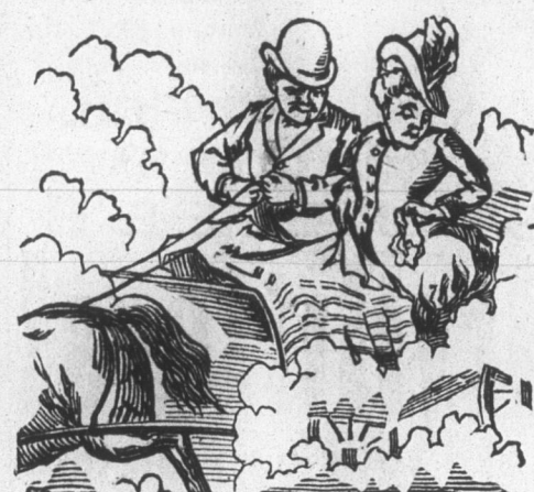
The Dusty Ride.

They will dye everything. They are sold every where. Price 10c a package—40 colors. They have no equal for Strength, Brightness, Amount in Packages or for Fastness of Color, or non-fading Qualities. They do not crack or smut. For sale by FRANK B. MEYER, Rensselaer, Ind. March 23, 1888.—1v.