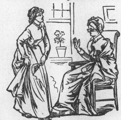
The Return Home.

"Just look at my dress. It is almost spoiled. We had one of those small sieve dusters. They are no good."