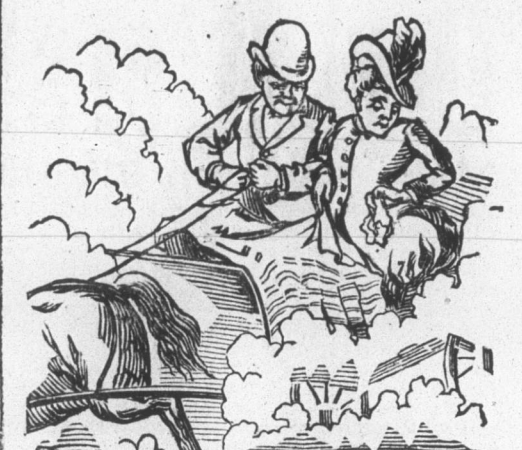
The Dusty Ride.

They will dye everything. They are sold everywhere. Price 10c a package—40 colors. They have no equal for Strength, Brightness, Amount in Packages or for Fastness of Color, or non-fading Qualities. They do not crack or smut.—For sale by FRANK B. MEYER, Rensselaer, Ind. March 23, 1888.—17.