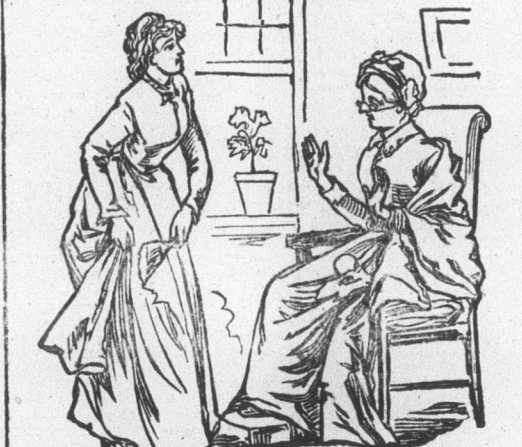
The Return Home.

"Just look at my dress. It is almost spoiled. We had one of those small sieve dusters. They are no good."