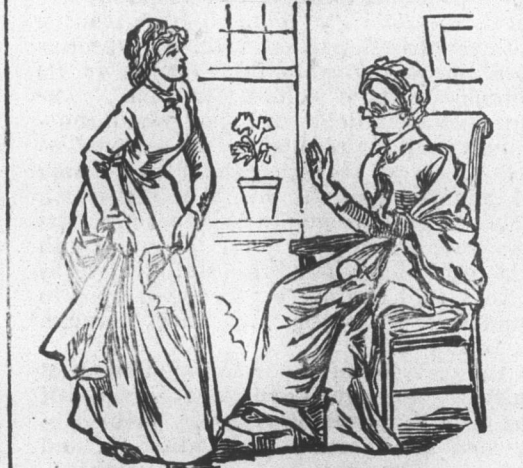
The Return Home.

"Just look at my dress. It is almost spoiled. We had one of those small sieve dusters. They are no good."