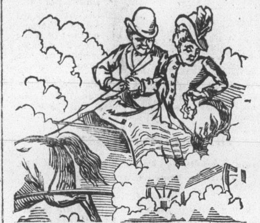
The Dusty Ride.

They will dye everything. They are sold every where. Price 10c a package—40 colors. They have no equal for Strength, Brightness, Amount in Packages or for Fastness of Color, or non-fading Qualities. They do not crack or smut. For sale by FRANK B. MEYER, Rensselaer, Ind., March 23, 1888.—17.