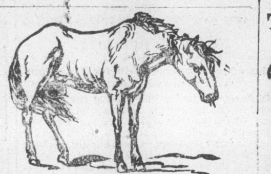
A COLD NIGHT.