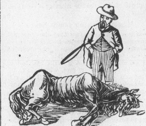
A COLD MORNING.

Two dollars spent for a 5/8 Horse Blanket would have saved a hundred dollars. Ask your dealer to show you these 5/8 Horse Blankets, which retail from $1.50 to $3.50: