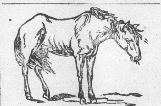
A COLD NIGHT.