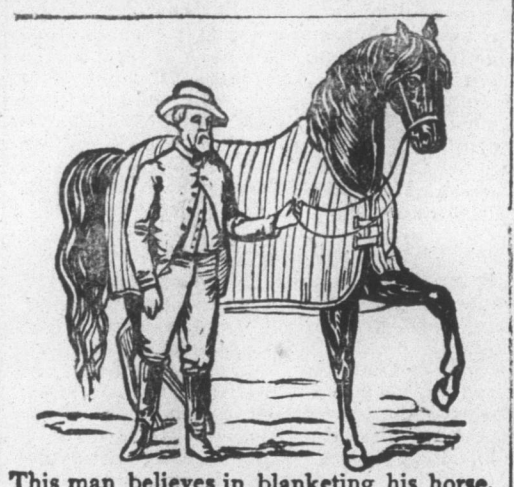
This man believes in blanketing his horse.