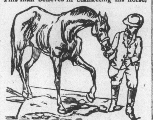
This man don't think a Horse Blanket does any good.

Isn't it plain that $1.50 to $3.50 spent for one of the following 5/8 Horse Blankets would have paid?