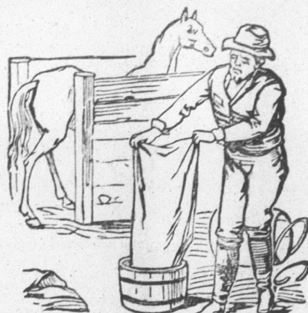
A horse that is not blanketed eats more to keep warm than one that is.