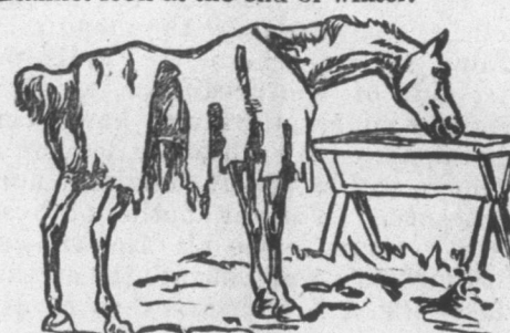
This is the way a horse and a poor blanket look at the end of winter.

A strong 5/8 Horse Blanket saves twenty times its cost.