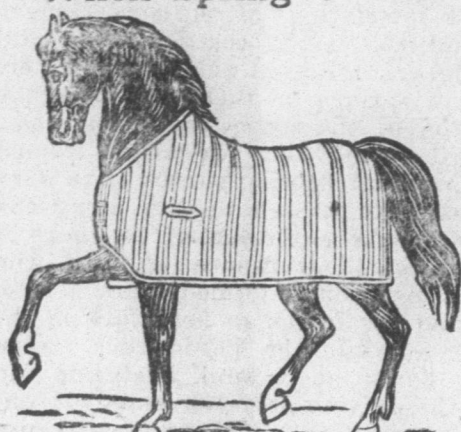
This is the way a horse and a 5/8 Horse Blanket look at the end of winter.