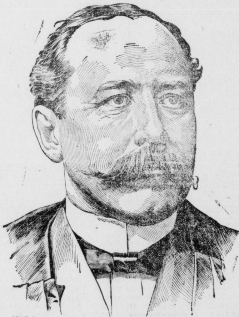
ALTON BROOKS PARKER.