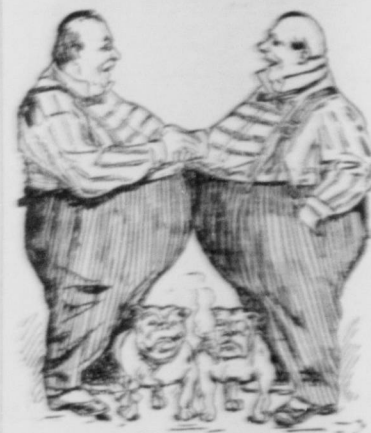
Two of a kind

You remember those funny fat fellows. Nothing old but the name. The cleanest, funniest and most successful comedy ever written.