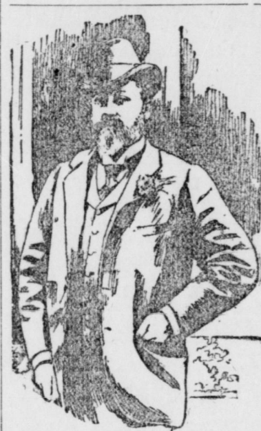
THE PRINCE OF WALES.

For a score of years the prince has practically performed all the social and public duties of a British monarch, while holding the position and receiving recognition only as the first