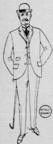
(COPYRIGHTED) ADMIRAL W. E. SCHLEY

36 Scotch suits at $4.00. Made from a light Scotch plaid goods, seams double sewed and taped, coat faced back to armhole. This suit would be cheap at $6.00. They will cost you only $4.00.