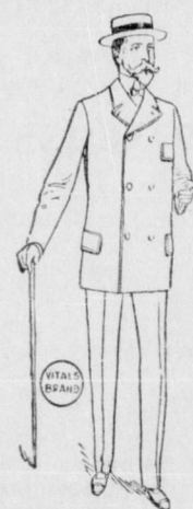
(COPYRIGHTED) ADMIRAL W. T. CAMERON

27 beautifully finished fancy worsted suits at $9.00. There are no better tailored garments made than these. There is no way to make them better. They are well worth $14. These 27 go at $9.00 each.