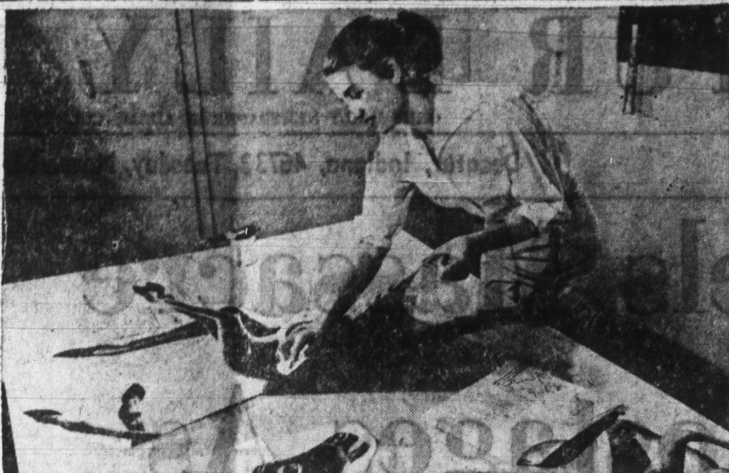
The lawn displays go together quickly and easily. The pattern cutouts are glued to plywood backing for support. Most lumber dealers offer these plans, or similar ones.

An objective glance at other rooms will suggest a variety of low-cost alterations and additions which will modernize the appearance and living qualities of any home.