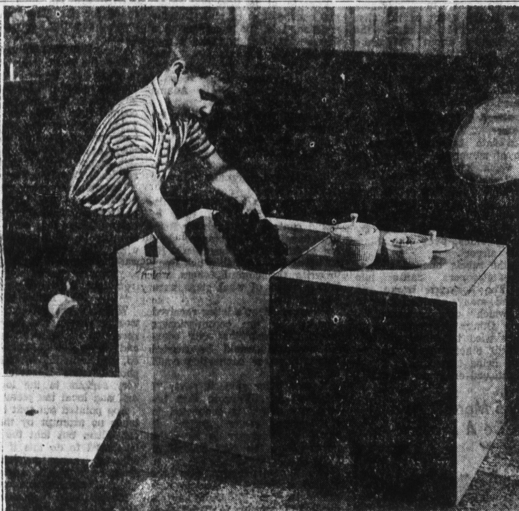
Here's how the do-it-yourself module boxes can be used in tandem to produce a recreation room coffee table. A single box makes a small end table; four of them together make a square-topped, standard-size end table. They're handy for storage and add a color accent to any room. Plans are available from American Plywood Association, Tacoma, Washington.