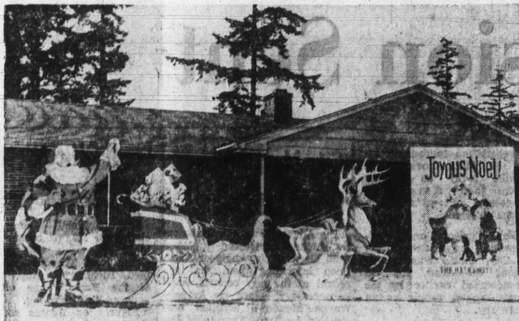
Christmas lawn displays like this add a lot of color to the season and are easy and practical to build. Most lumber dealers offer these plans, or similar ones, that can be applied over plywood cutouts.