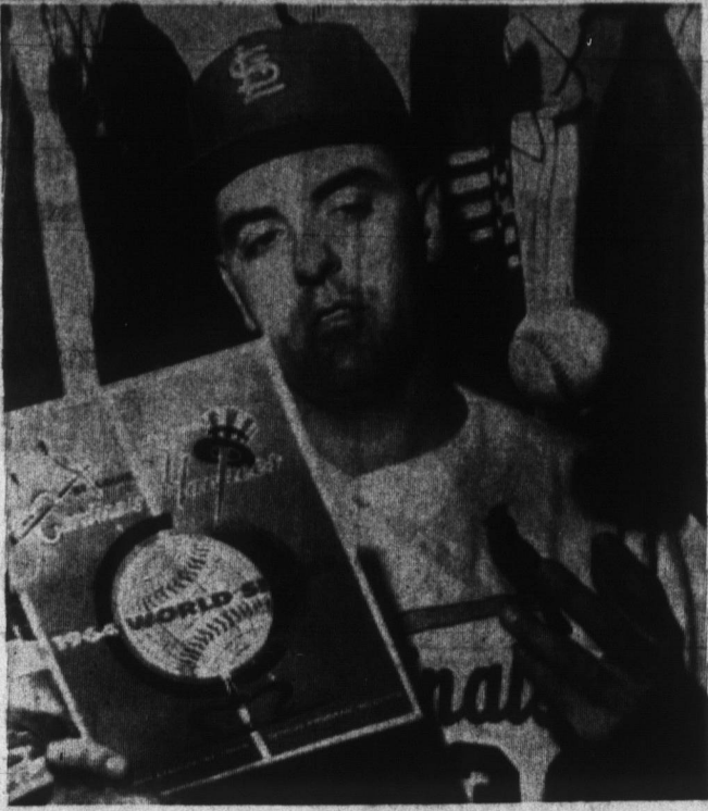
SIMMONS SET —Curt Simmons, Cardinal southpaw, appears to be the most relaxed man in the world as he relaxes in the Busch Stadium dressing room of the National League champs. Simmons was the starting hurler in today's game, as the Cards attempted to clinch the World Series.