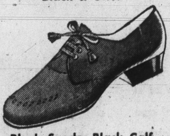
Black Suede—Black Calf Deer Brown.