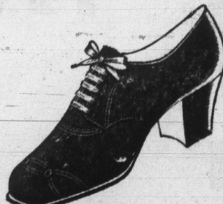
Black & Otter