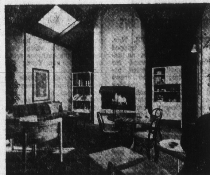
The interior of the new family room the Chlarovanos built is spacious and it appears even more so because of the vaulted ceiling. The ceiling was built with a flooring material—2.4.1 plywood 1 1/2-inch thick—over supporting joists four feet apart.

Enough plywood was produced last year to roof New York City and still have enough left over for a stack 185 miles high.