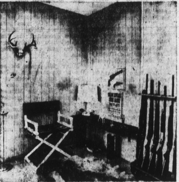
With the wide variety of hardboard panels available at building supply dealers, two or more hardboard panel products can be used in combination to achieve a dramatic and distinctive room setting. Here wood grained finished paneling is combined with a richly textured accent panel to provide complete wall glamour for a handsomely masculine den.