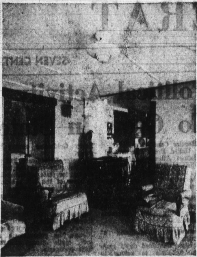
The old living room was too small and the walls and ceiling were in disrepair. The Thuresons moved onto the original homestead and lived in it for almost a year before the remodeling job.