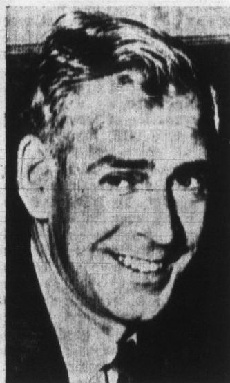
Jack Buck (Welcome!)

Without any fanfare, and publicity, the Old Redhead has stepped down. Thank goodness! It wasn't that Red made a lot of mistakes, he just forgot every once in a while the name of team the Bears were playing. There were a few times when the Bears were having a good game, that he even forgot to mention the fact that there was another team playing. The Bears, at least those of last season, didn't pull off many exciting plays, and usually didn't permit their opponents to do so either. If that wasn't bad enough to watch, we had to listen to Red trying to explain what was going on on the field.