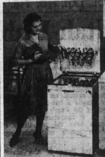
FOR A CERTAIN SPARKLE, this homemaker does her party glasses in the electric dishwasher.

Generally, glassware needs no rinsing before being placed in the dishwasher. If it's not going to be washed until later, use the pre-rinse cycle as soon as the glassware has been placed in the dishwasher. Since the new electric dishwashers have extremely powerful washing action, only