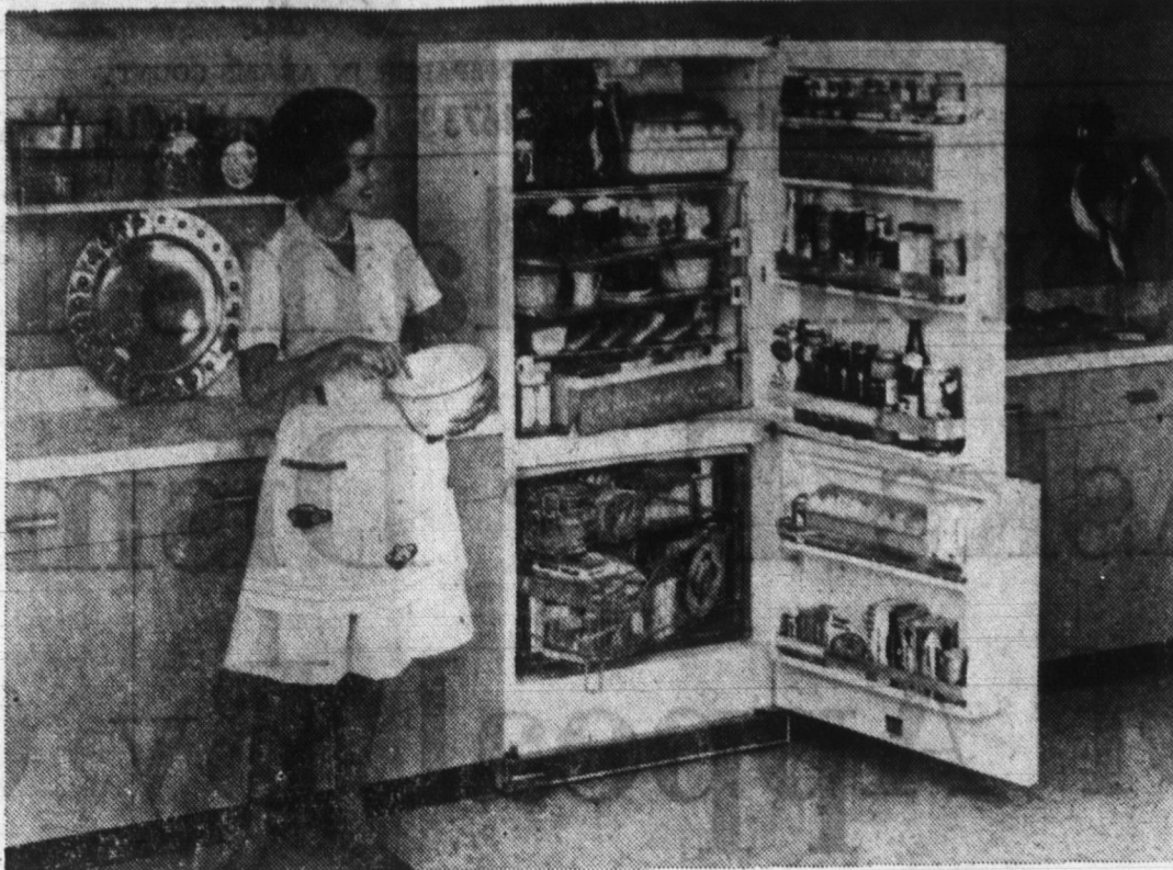
PLENTY OF SPACE for both fresh and frozen food in this new electric refrigerator-freezer allows homemaker to stock up at supermarket just once a week. The large freezer section below is free of frost, and so is the 11.8 cubic-foot refrigerator section.

This does not mean having a giant in the kitchen, however. Refrigerator-freezer manufacturers have come up with improvements that give more fresh and frozen food storage space without a corresponding increase in the exterior size of the unit. Some of the new big-family units, for example, take up just about